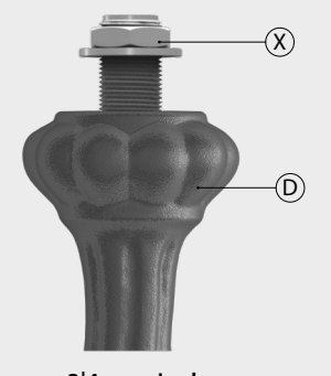
3|4 gas nipple

The die-cast decoration (D) has a threaded hole for a 3/4 gas stainless steel nipple for the standing installation of the lighting fixture (X).