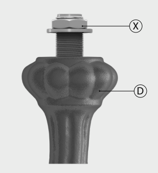
3|4 gas nipple

The die-cast decoration (D) has a threaded hole for a 3/4 gas stainless steel nipple for the standing installation of the lighting fixture (X).