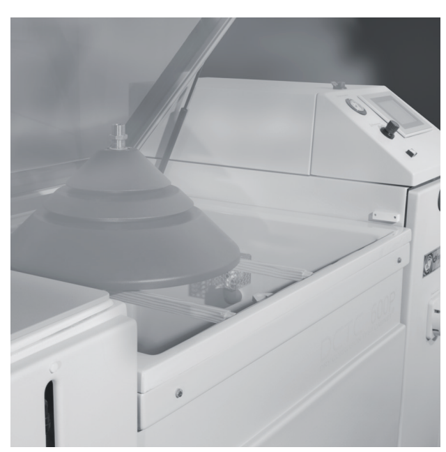
Salt spray test | FLORIDA TEST

The top quality of such treatments is confirmed by the succesfull results of specific salt spray test (all products exceed widely 2.500 hours) and the strictest international tests, among which FLORIDA TEST.