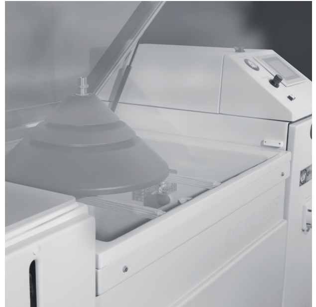
Salt spray test | FLORIDA TEST

The top quality of such treatments is confirmed by the succesfull results of specific salt spray test ( all products exce- ded widely 2.500 hours) and the strictest international tests, among which FLORIDA TEST.