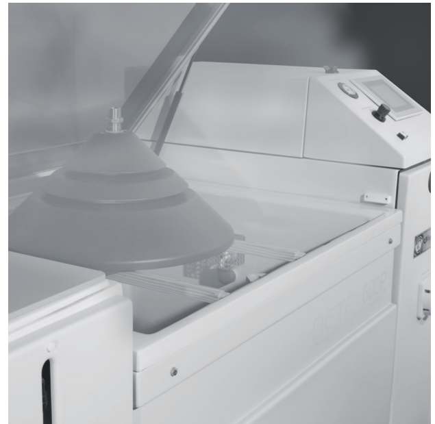
Salt spray test | FLORIDA TEST

The top quality of such treatments is confirmed by salt spray tests performed in accordance with standard ISO 9227:2017 Neutral Salt Spray test (NSS).