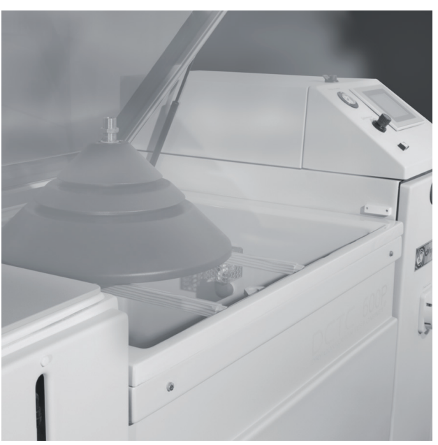
Salt spray test | FLORIDA TEST

The top quality of such treatments is confirmed by salt spray tests performed in accordance with standard ISO 9227:2017 Neutral Salt Spray test (NSS).